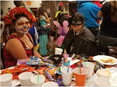
Park Inn by Radisson hosted our annual Halloween Party for our foster children and their families in October.