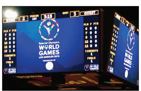
Youth from Ettie Lee participated as volunteers at the Special Olympics when they were in town.