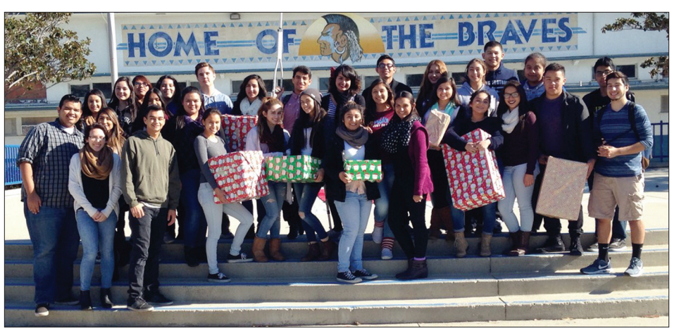
Baldwin Park High School