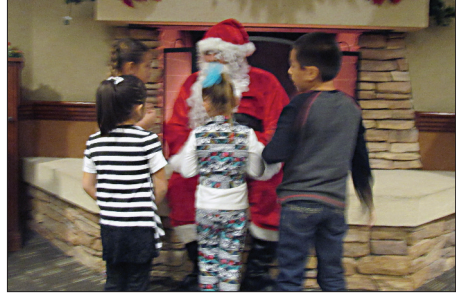
All of the children had wishes for Santa at our Foster Family Holiday Party.