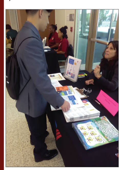
Job Fair-Young men from our Fontana Home attended a job fair.