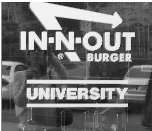
The residents of Ettie Lee's John Eccles home attended In-N-Out University. They learned all about their rich history and were rewarded with an In-N-Out lunch.

Saving Lives, Changing Lives and Building Hope for children and families in family-like settings.