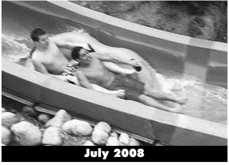
Over the summer boys from our Oak Knolls Home in Azusa enjoyed some time at Raging Waters in San Dimas. Each and every month, Friends of Foster Children fills needs such as community outings, video games, board games, books, athletic equipment, cameras, clothing, art supplies as well as some medical expenses and home furnishings. During the Christmas Holidays they fulfill the three wishes of each of our group home residents.