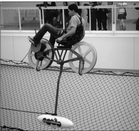
Residents on a field trip to the California Science Center got to ride on the suspended bicycle. Whoaaaaaa!