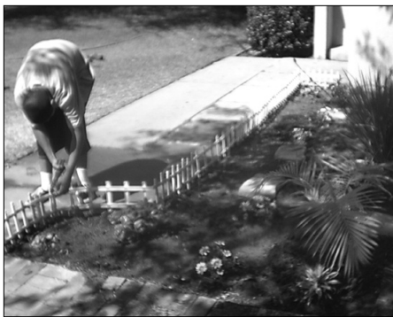
During the summer some residents at our John Eccles Home planted a garden.