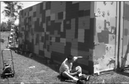
Two of our homes were fortunate to be able to participate with the Big Sunday organization again this year. At our Fontana home volunteers painted a new basketball court as well as a mural on a former "eyesore." Volunteers at our Waterflow home did some landscaping as well as installed privacy fencing.