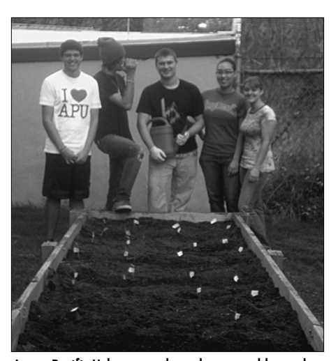
Azusa Pacific Volunteers planted a vegetable garden at Ettie Lee's Brandes home.