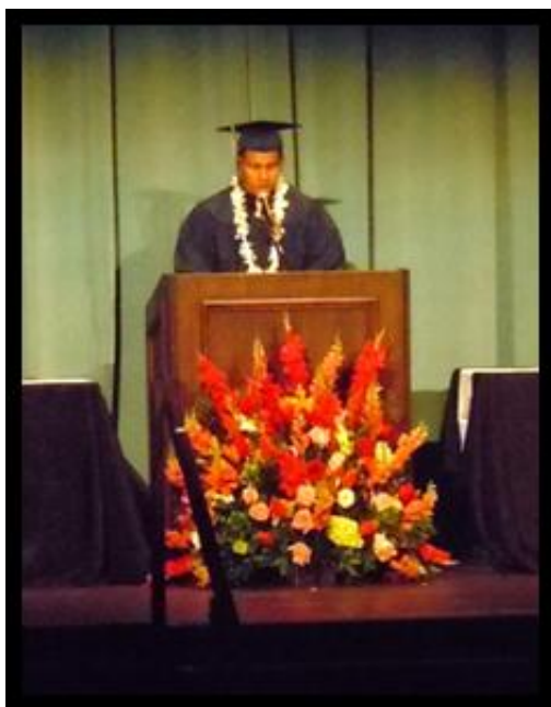
Ettie Lee Resident Giving Commencement Speech On June 1st Ceremony