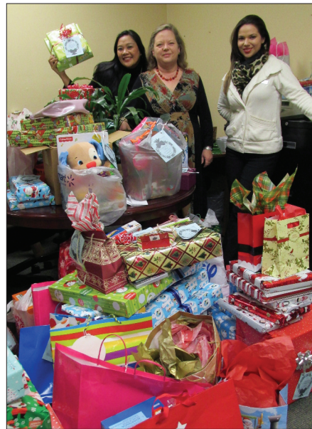
Pacific Palms Resort