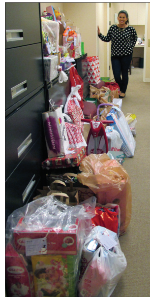
Lewis Brisbois Bisgaard & Smith LLP