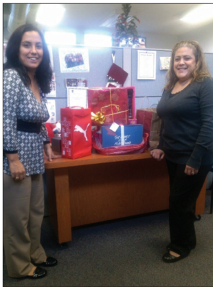
Baldwin Park Unified School District