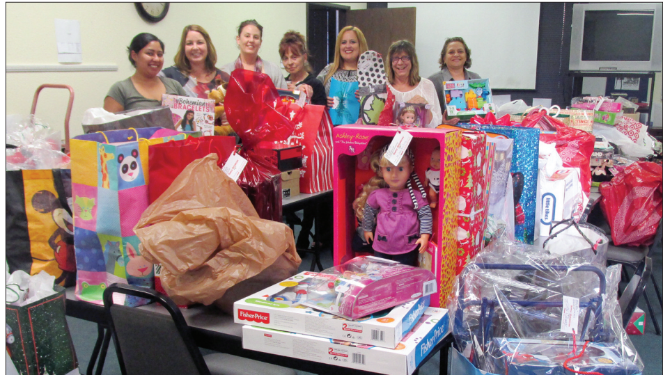
Haemonetics Manufacturing Inc.

Alcoa Fastening Systems Lewis Brisbois Bisgaard & Smith LLP Denny's on Grand and Azusa Blvds. Friends of Foster Children Haemonetics Manufacturing Inc. Baldwin Park High School Baldwin Park Unified School District Pacific Palms Resort