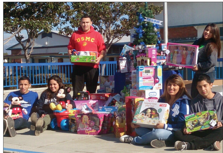
Baldwin Park High School