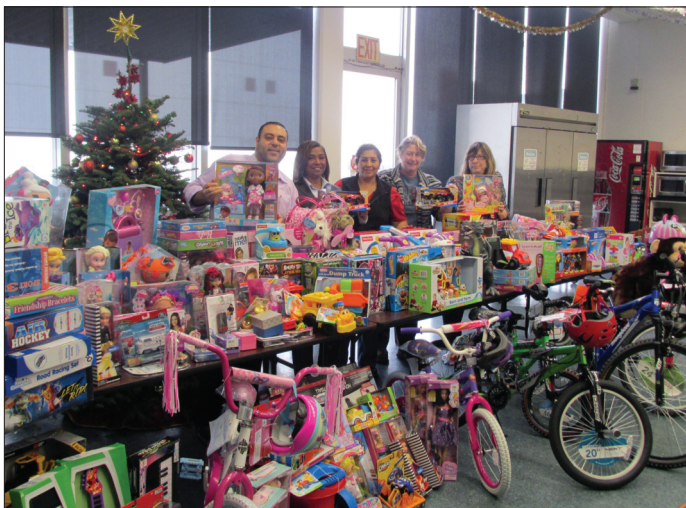
Alcoa Fastening Systems